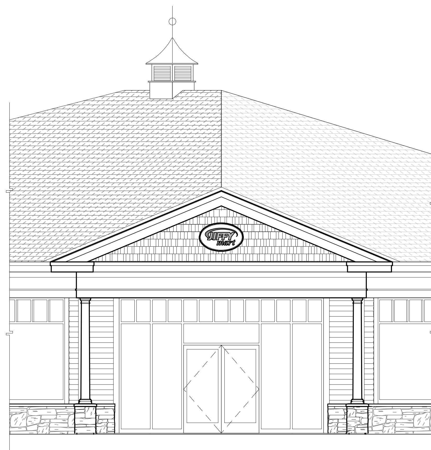
○ ENTRY ELEVATION