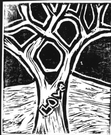
Artwork By: Caroline Donovan-Attwood-Grade 6

In accordance with Vermont Statutes, there are certain procedures, which if followed, can assure paper ballot voting on any given article. Any voter may request a paper ballot vote on any article in the Warning. A total of seven voters must request the paper ballot vote. THEREFORE, IF YOU WISH ANY ITEM TO BE VOTED BY PAPER BALLOT, PLEASE ASK THE MODERATOR FOR A PAPER BALLOT VOTE. Six additional voters must then join your request. We suggest that you request a paper ballot vote prior to a voice vote.