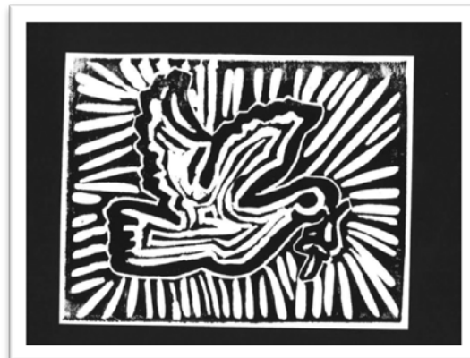
Artwork By: Eliza Burbela – Grade 5