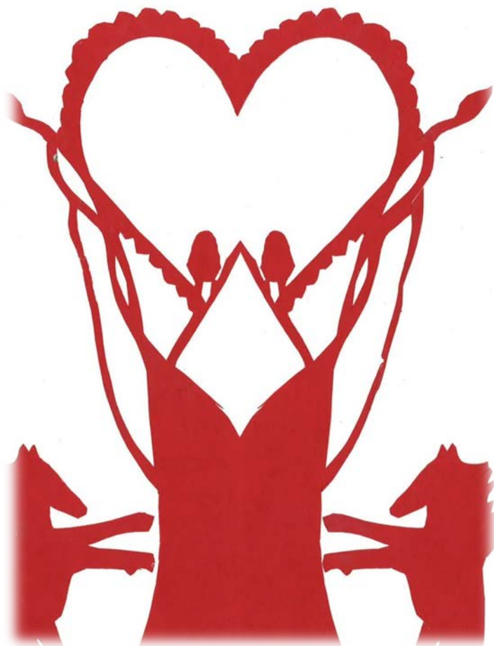
Artwork By: Marlee Monroe – Grade 4