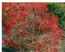
Ilex verticillata 'Red Sprite'