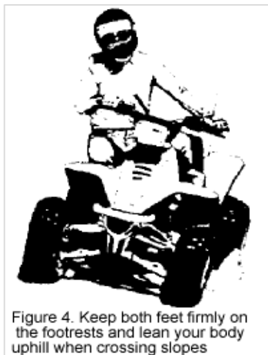
Figure 4. Keep both feet firmly on the footrests and lean your body uphill when crossing slopes

Apply brakes lightly on slippery surfaces. When descending a hill, shift to a lower gear for engine braking rather than riding the brakes for an extended period of time.