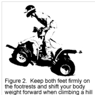
Figure 2. Keep both feet firmly on the footrests and shift your body weight forward when climbing a hill